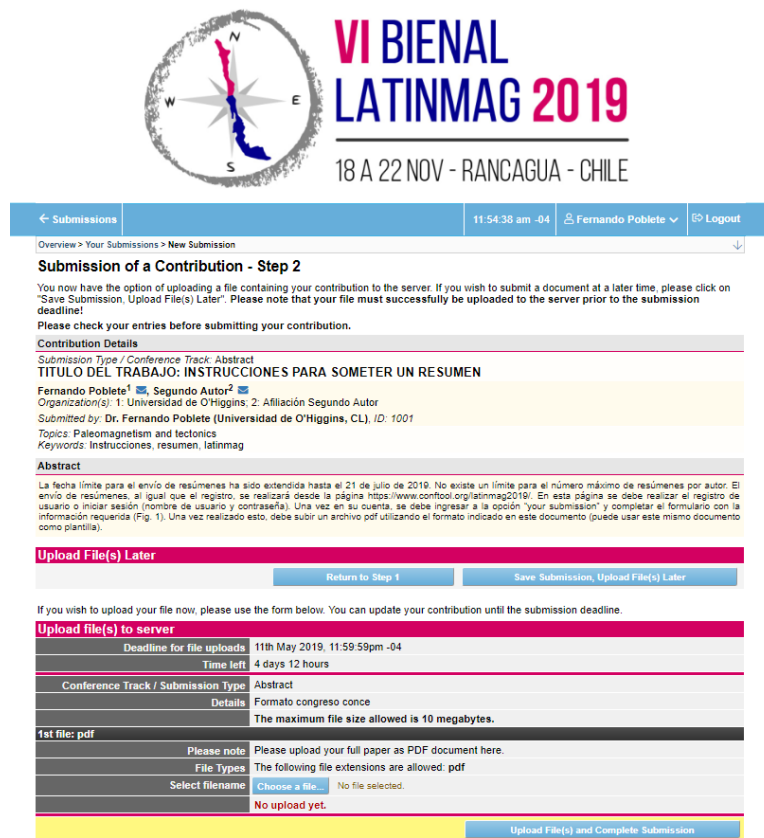
Figure 2: Step 2 of 2. To complete the summary submission process, do not forget to upload the associated pdf file, using the format described in this document.